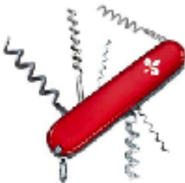
French Army Knife