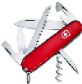
Swiss Army Knife